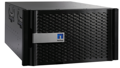
Figure 1) NetApp FAS8000 controllers.